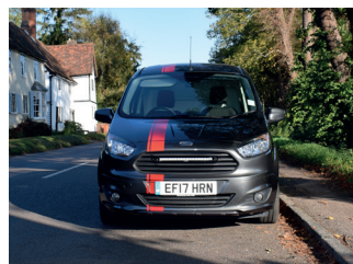
FORD TRANSIT COURIER 2014+