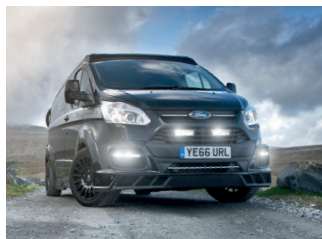
FORD TRANSIT CUSTOM 2012+