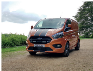
FORD TRANSIT CUSTOM 2018+