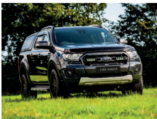
FORD RANGER 2019+

Thank you for choosing a Lazer Lamps product. Vielen Dank dafür, dass Sie sich für ein Produkt von Lazer Lamps entschieden haben. Merci pour choisir un produit de Lazer Lamps. Gracias por la seleccion de productos de Lazer Lamps.